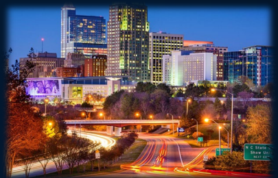
MINNEAPOLIS October 10, 2023