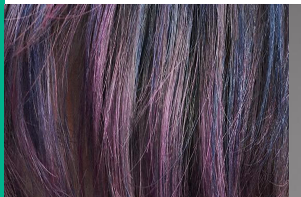
TOPCHIC & COLORANCE REVEALED

Experience the world of Topchic & Colorance. Gain confidence to use demi & permanent hair color effectively within the Goldwell Service Cycle. Learn the tips and tricks that make Goldwell the perfect partner to all your hair color needs.