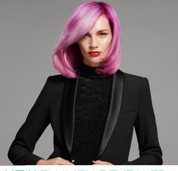
NEW ELUMEN REVEALED – ELUMEN PAINTBOX

Highlighting, decolorizing and toning services: we have it covered. Learn about the endless ways to create the perfect blonde using Goldwell's blonding portfolio.